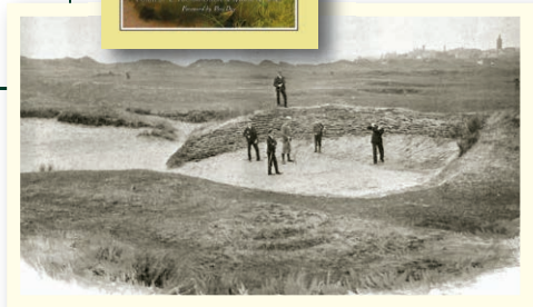
Hell Bunker at St. Andrews as it was 'maintained' c. 1897