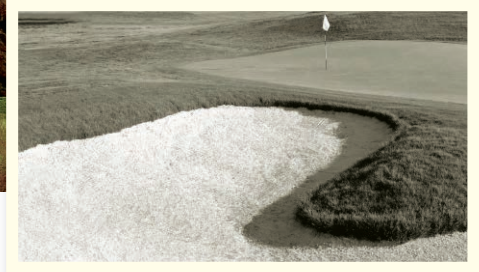
The goal of a bunker program is to fix the problem for the long term, not just for immediate gratification.

Bunkers are among the key ingredients of golf — they serve to make the game more interesting and entertaining. But when they have no soul or purpose, they waste resources. And when they are always in need of repair, it is time to consider rebuilding them to last longer and function better.