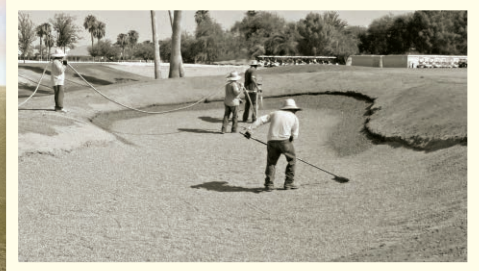
The durable gravel liner of the Better Billy Bunker System™ has become a proven and long-lasting alternative