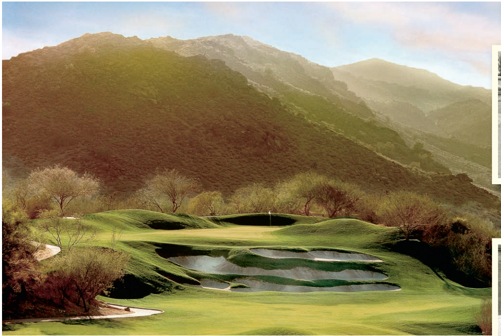
ARIZONA GRAND RESORT HOLE NO. 13

The belief that bunkers last just 7-9 years is quickly fading as we prove better methods of renovation & rebuilding